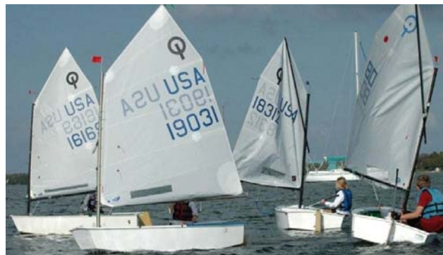
Team Action at Opti-Fest

With five top 10 finishes from just nine competing sailors, Upper Keys Sailing Club continues to make big waves in the US Sailing world. This time the 94 boat fleet at the US Sailing Opti-Fest Regatta, Jensen Beach was on the receiving end of their dominance, and for such a small program the odds of consistently high finishes is staggering.