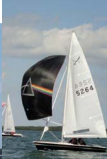
Buccaneer Lunatic from Long Island, NY