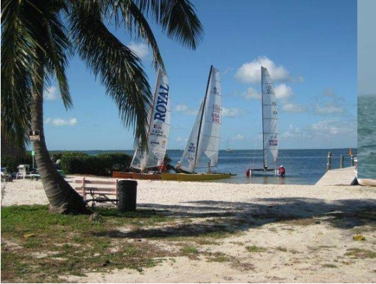
First three boats to reach the beach at Caribbean Club